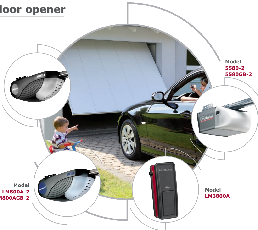
Model LM1000A-2 LM1000AGB-2